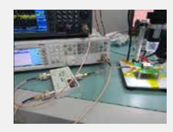
Library of Test Equipment on Site